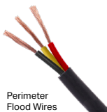
Perimeter Flood Wires